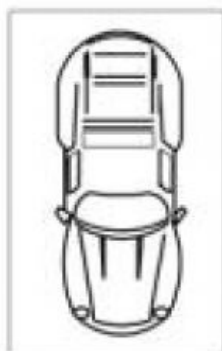
Single Car Space